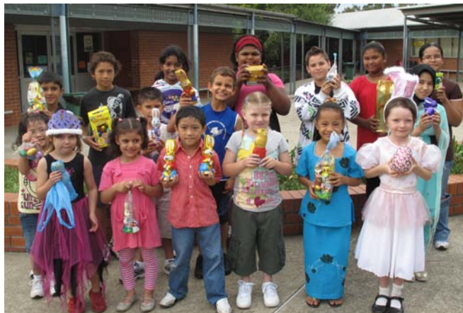
Above: Some students with their Easter egg donations for Easter Mufti Day.