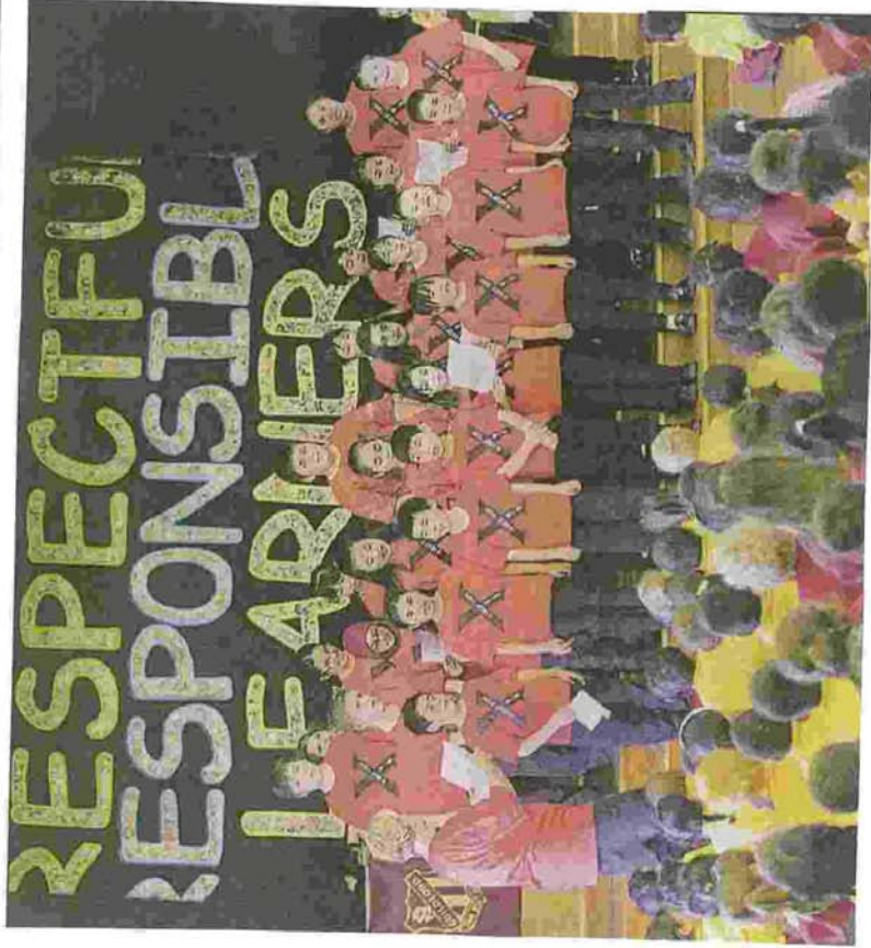
WEARING costumes from their recent performance in Our Spectacular at the Sydney Opera House, the Guildford Public School choir sang Come Play Your Part at the school's assembly. The song was written for the national synchronised musical event, Music: Count Us In. See story on page 10