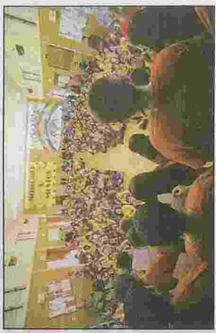
Sing-a-long: Students take part in the national 'Music: Count Us In' project.