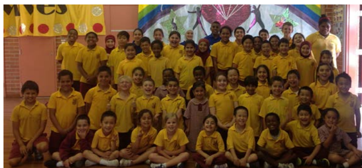
Above: Winners who received 20 or more Guildford Superstars