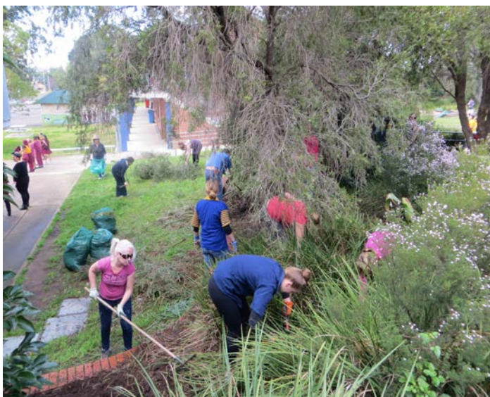
Hard At It!